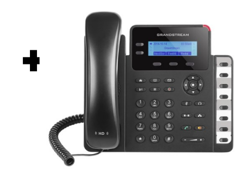
2-Line Phone (GXP1628)